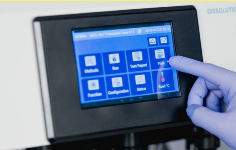
7" colour high resolution Display with touch screen inter face